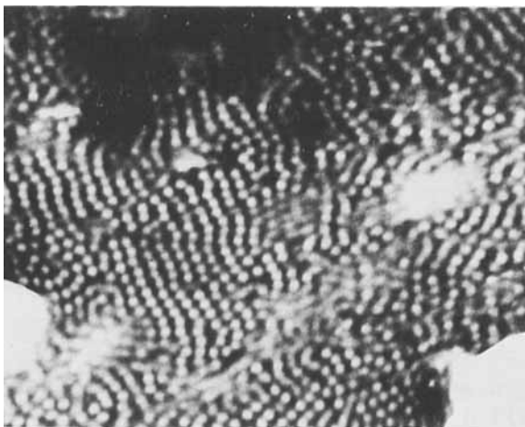
Fig. 2. Electron micrograph of the polymer shown in Fig. 1, stretched about 50% (stretching direction horizontal).

larity of arrangement of the polystyrene domains in the polybutadiene matrix is related to the uniformity of molecular weights of the individual blocks.